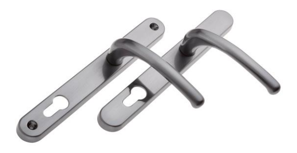
1 - Hardex Graphite handle